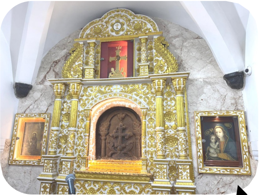
St. Thomas brought this picture of Our Lady in 54 A.D.