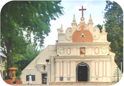
Our Lady of Light Shrine Chennai, India

Built in 1516, Our Lady of Light Shrine is one of the oldest churches in Chennai. Legends state that in 1500 A.D. eight Franciscan Portuguese priests on their way to India from Lisbon got lost in the sea. They worshipped Virgin Mary for help and were guided by a bright light that led them safely to a forest area.