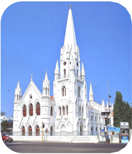
St. Thomas Cathedral Basilica Chennai, India